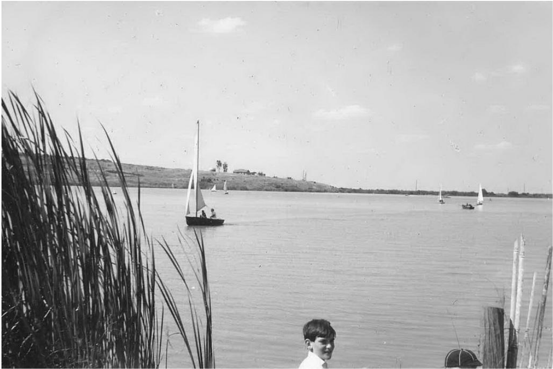
The Scenic Nairobi Dam – seen here in 1960 situated not far away from Wilson Airport. It is no longer in existence as a dam. (See below)