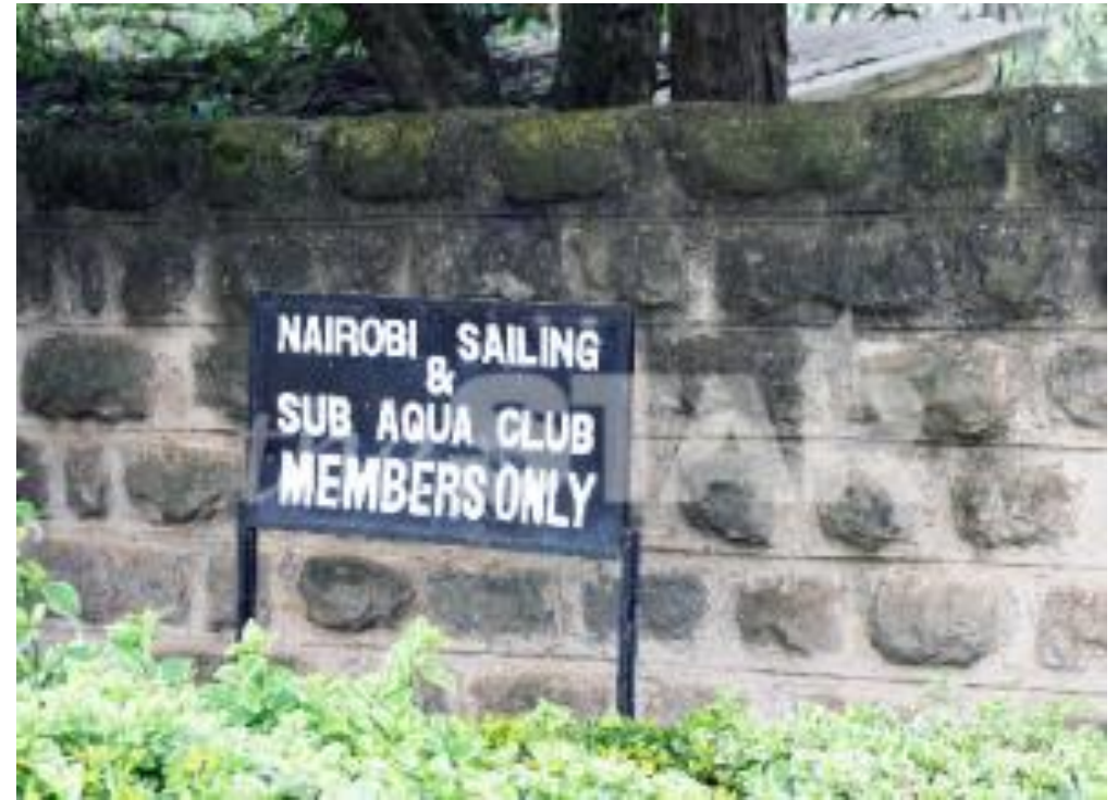
Nairobi Dam: The old board is still there

This is what is left of the former Nairobi Dam built in 1953, the exclusive sailing resort where the City's elite until 1988 used to spend their weekends in boats, swimming or simply a family picnic.