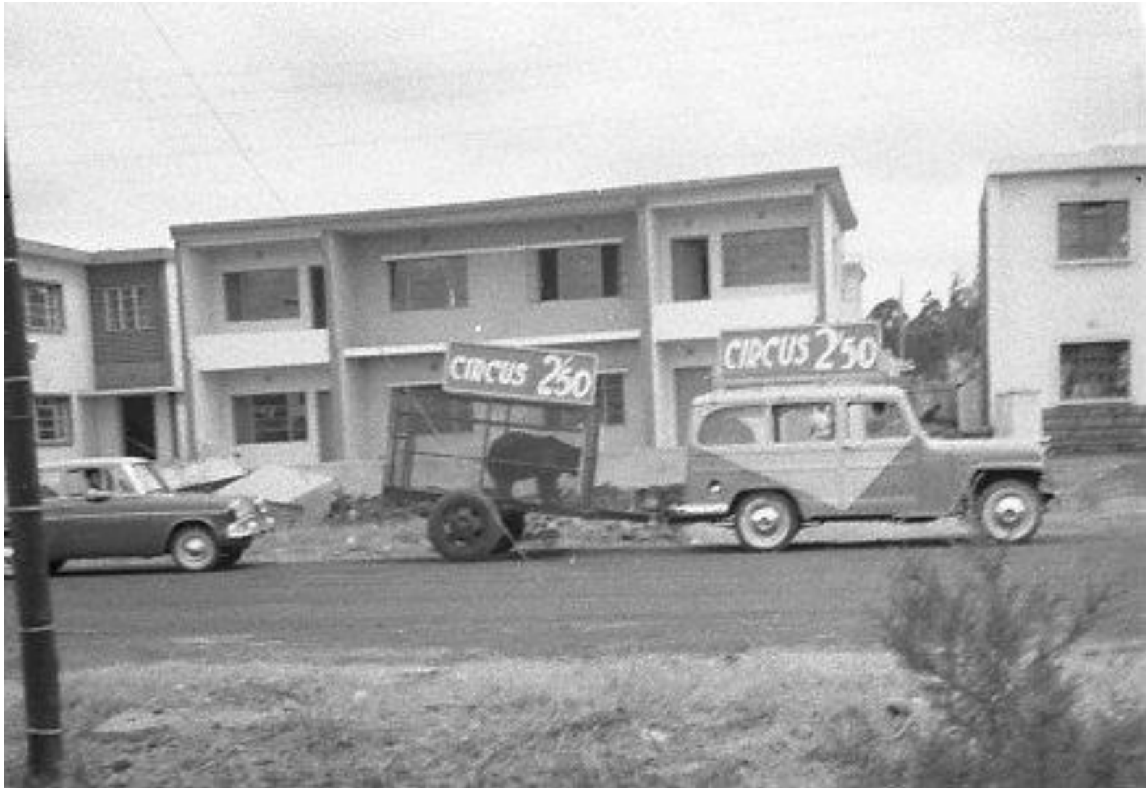
Circus Brazil is also in town in early 1960 seen here doing sales promotion in Nairobi West with “Lily” the bear. Tickets selling at 2 shillings and 50 cents must have been on special offer since peak viewing tickets were selling about 5 to 10/- per head. It did seem expensive then for an average Asian family.