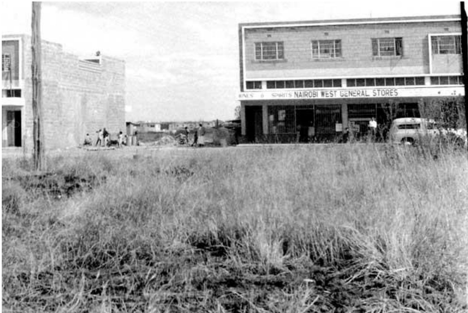
The Nairobi West General Store 1959. For its location, see below