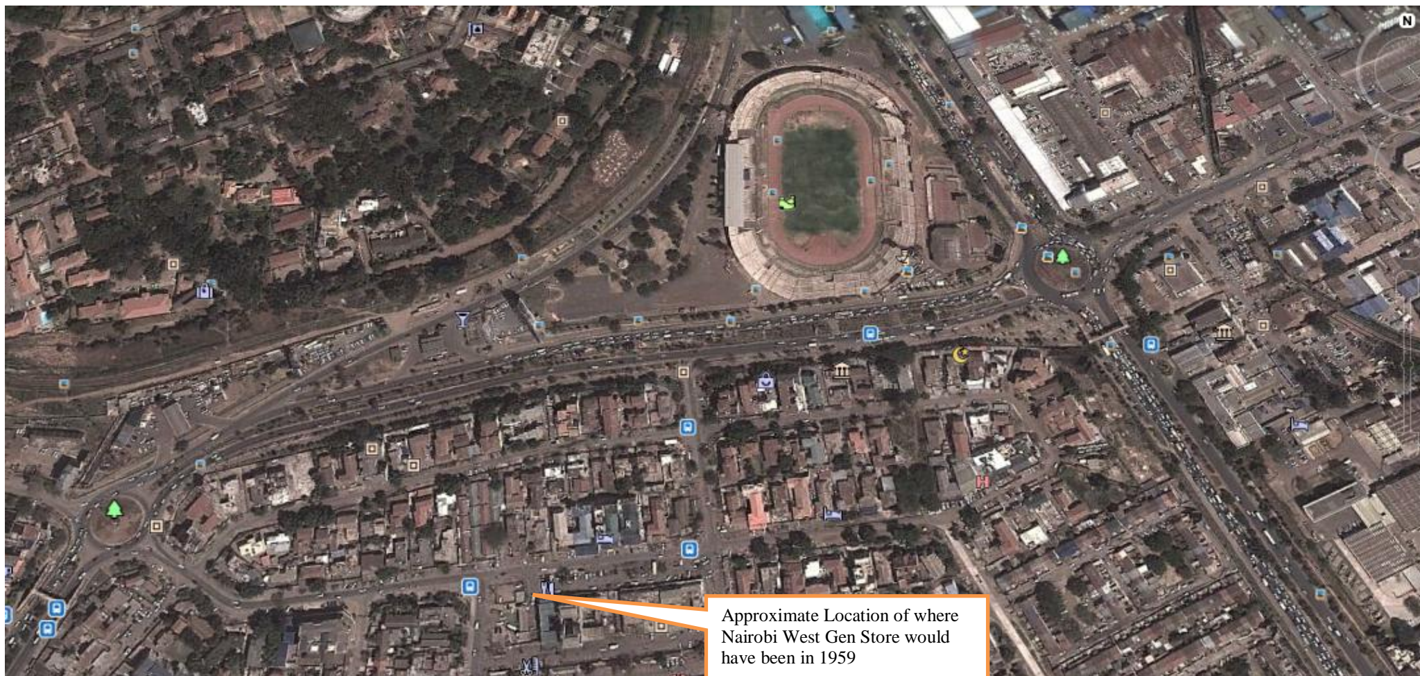
Google Earth snap shot 2014