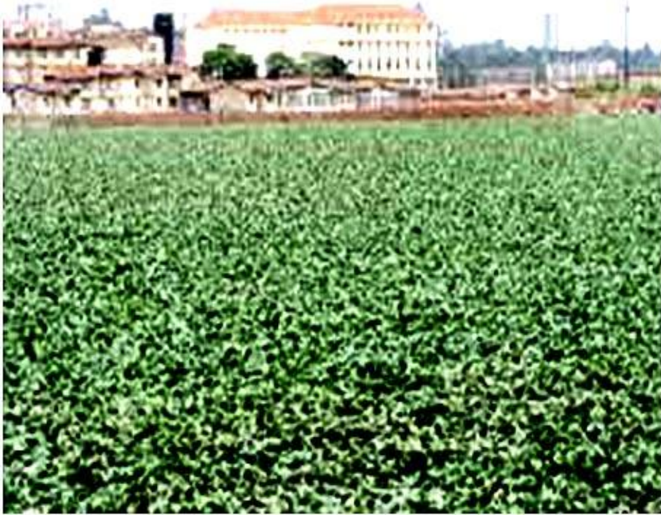
Nairobi Dam recent (picture taken from almost same location as above)

This is what is left of the former Nairobi Dam built in 1953, the exclusive sailing resort where the City's elite until 1988 used to spend their weekends in boats, swimming or simply a family picnic.